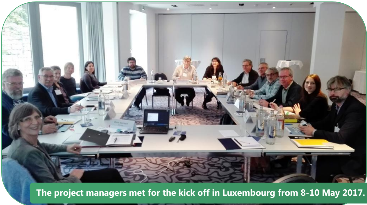
The project managers met for the kick off in Luxembourg from 8-10 May 2017.

Besides the project partners, representatives of the Consumers, Health, Agriculture and Food Executive Agency (Chafea) and of the DG SANTE participated in the kick-off meeting. They underlined their strong interest in "Localize It!" and their high expectations for the project's results.